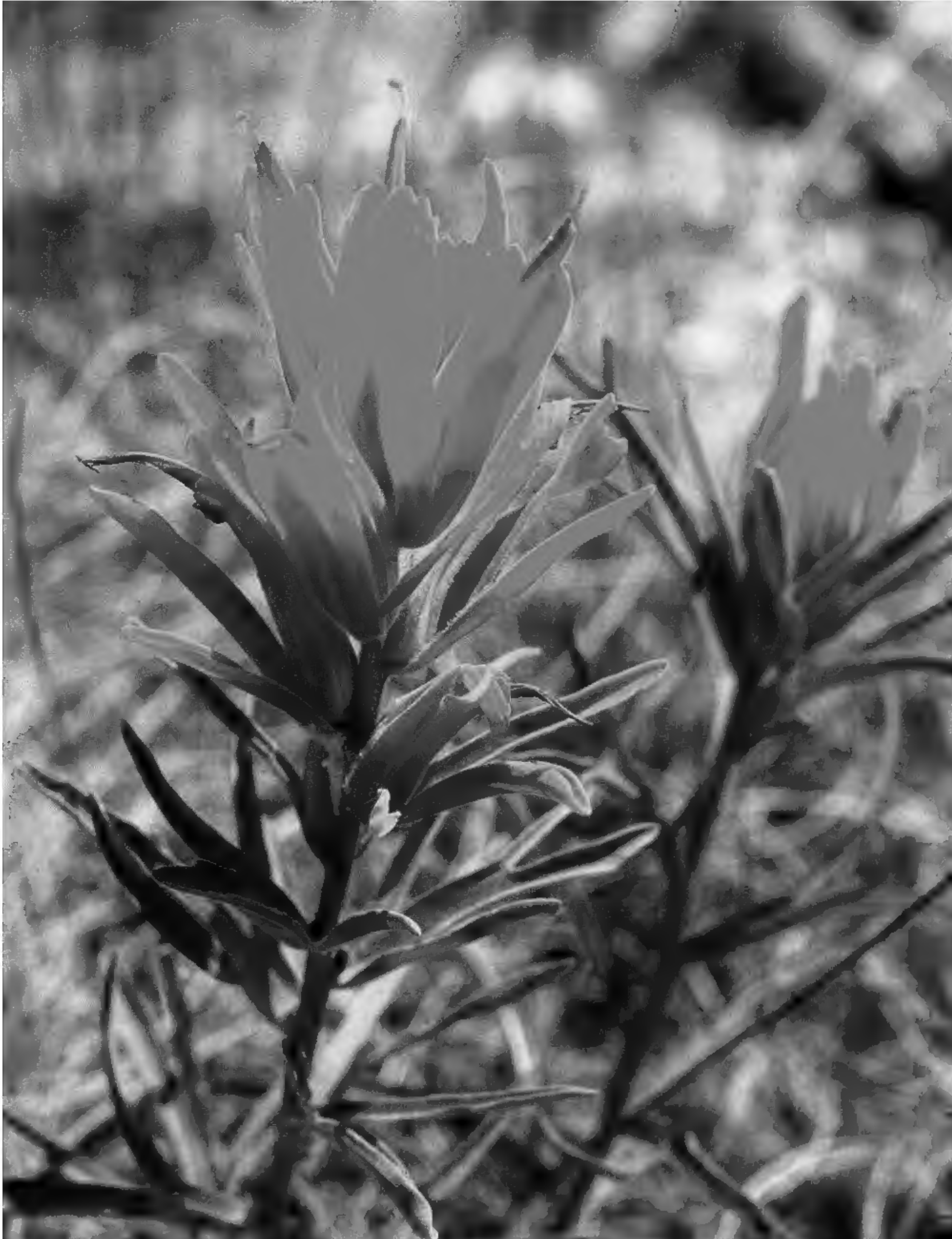
Figure 10. Castilleja lindheimeri in typical form. Cypress Creek Park, northwest of Austin, Travis Co., Texas, 3 Apr 1990.